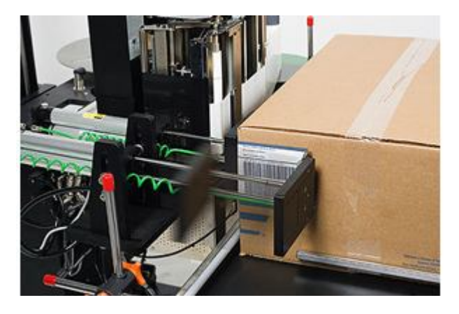
Example of labelling machine