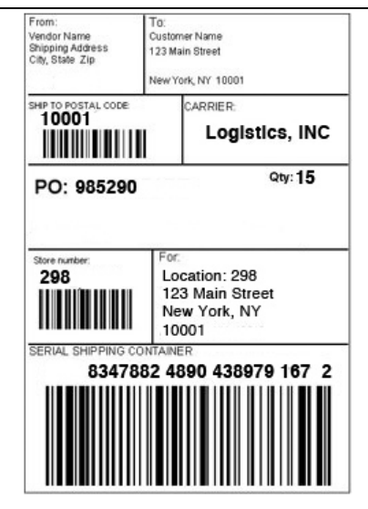
Example of label printed with a labelling machine